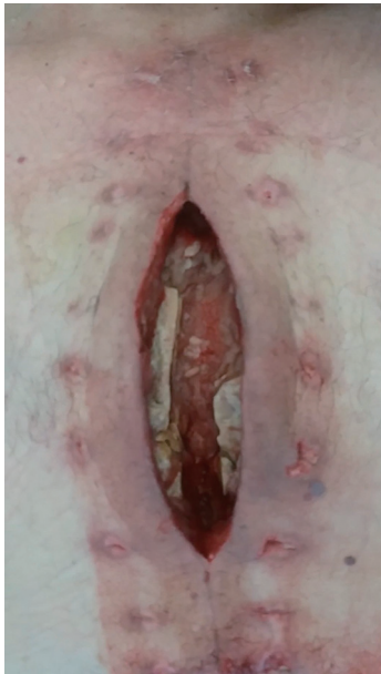
Figure 1 Sternum aspect of patient #2 before ceramic sternum implantation showing a great destruction and bone loss.

with an antibiotic for a local release and the protection of the implanted device in an infected environment. Indeed, local delivery allows eradicating bacteria present in the wound, avoiding them to colonize the prosthesis. The same type of combined device has already been successfully used for chronic osteomyelitis due to Methicillin Resistant Staphylococcus aureus (MRSA) (9). Thus, this antibiotic loaded ceramic device combines the possibility of chest wall stabilization and its self-protection during implantation. In this study, we describe the use and the follow-up of this device, including pulmonary function tests (PFT) in four patients.